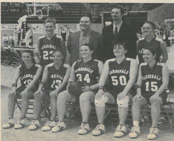
Above: The Lady Cardinals pose along with their coaches after their big win at state.