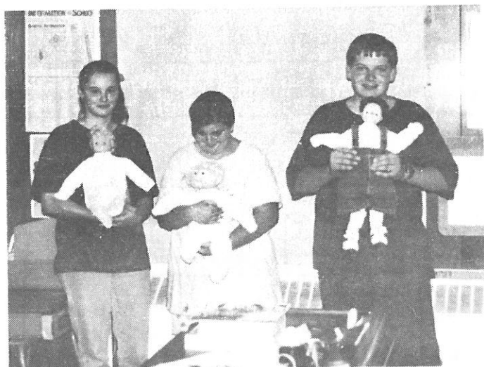
Home Economic students show off their flour children.