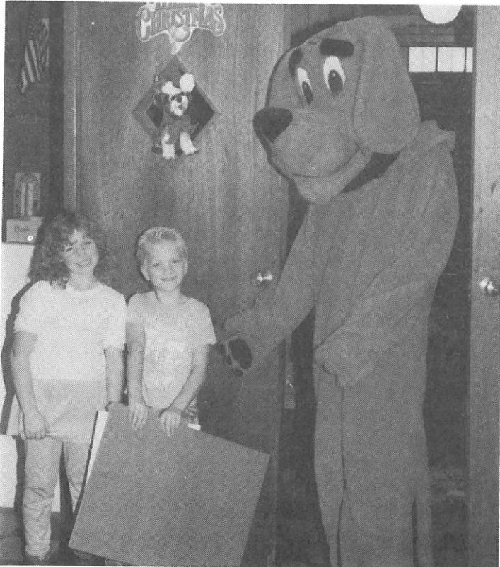
Clifford, The Big Red Dog, visited Chadwick School during the annual bookfair. All elementary students enjoyed meeting Clifford.