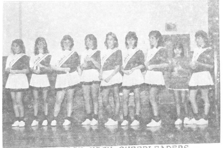
CHADWICK HIGH CHEERLEADERS