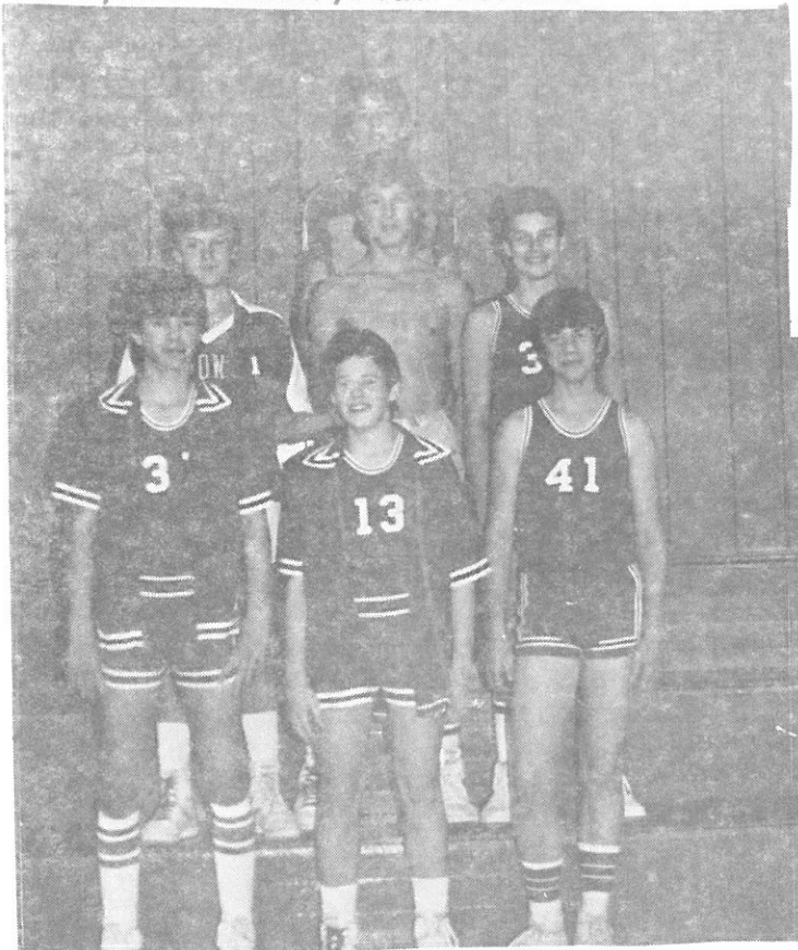
JR. VARSITY BASKETBALL PLAYERS