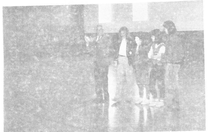
ALL CONFERENCE VOLLEYBALL