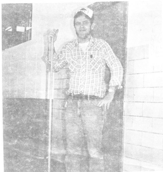
GET WELL SOON BOB!

Slow down; follow these rules. Safety is no accident.